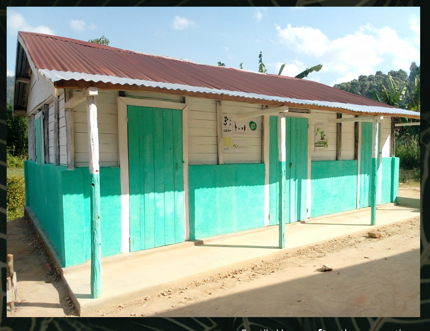
Santi's House after the renovation